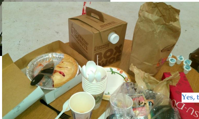
Yes, there was food and drink...